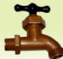
ITEM NO:ZX8090 MATERIAL:ABS PVC