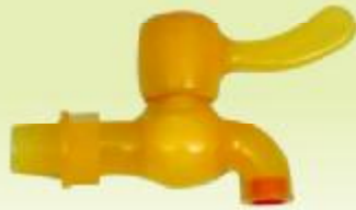
ITEM NO:ZX8001 MATERIAL:PP