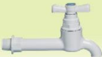
ITEM NO:ZX8063 MATERIAL:PVC