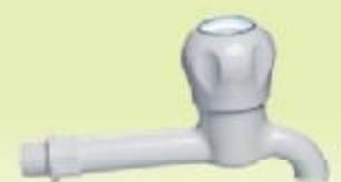
ITEM NO:ZX8062 MATERIAL:PVC