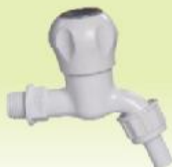
ITEM NO:ZX8066 MATERIAL:PVC