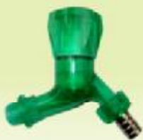
ITEM NO:ZX8055 MATERIAL:PP ABS