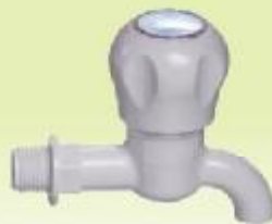
ITEM NO:ZX8060 MATERIAL:PVC