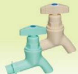
ITEM NO:ZX8091 MATERIAL:ABS