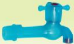
ITEM NO:ZX8021 MATERIAL:PP PVC