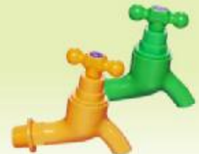
ITEM NO:ZX8052 MATERIAL:ABS