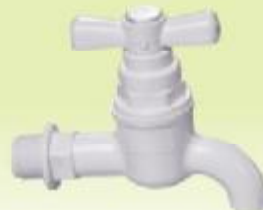
ITEM NO:ZX8061 MATERIAL:PVC