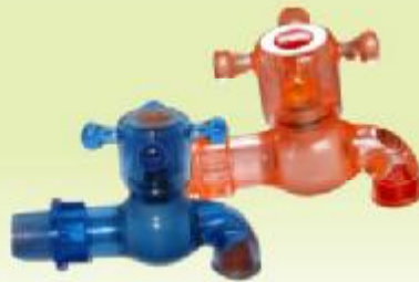
ITEM NO:ZX8002 MATERIAL:PVC