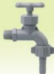
ITEM NO:ZX8092 MATERIAL:PVC ABS