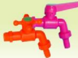
ITEM NO:ZX8032 MATERIAL:PP