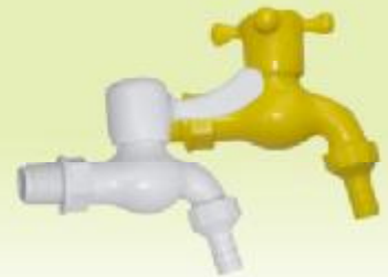
ITEM NO:ZX8012 MATERIAL:PP PVC